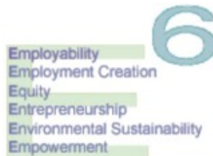
YES Campaign's Framework of 6Es

In September 2002, under the joint chairmanship of President Bill Clinton and First Lady Mrs. Suzanne Mubarak 1600 delegates (1000 youth) from 120 countries launched the decade long YES Campaign. The YES Campaign is a youth-led response to the enormous global challenge of youth unemployment. In over 70 countries, young leaders are bringing together diverse stakeholders through the infrastructure of YES Country Networks to take actions that result in productive and sustainable employment for youth. The YES Campaign works with national and global partners to develop and deploy effective programs that realize the following goals: